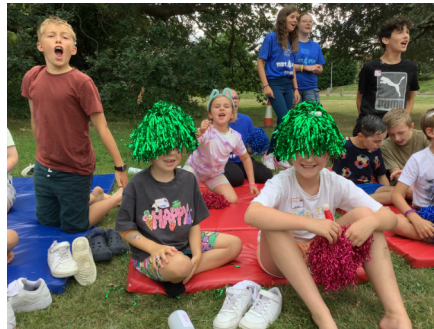
Sibs during Silly Sports

If your child is struggling with their sibling's need, check out www.sibs.org.uk resources.