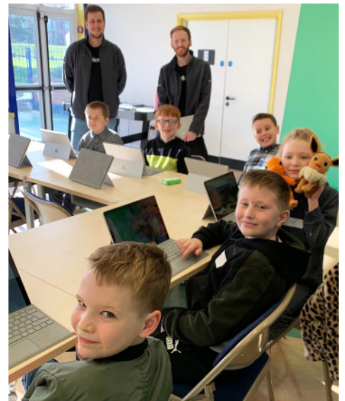
The Microsoft Team lead an attentive audience during one of our Microsoft workshops.