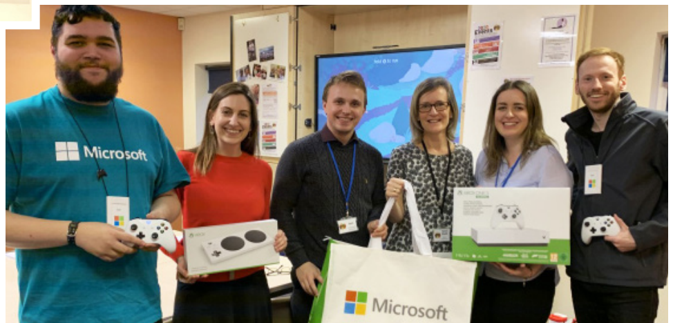
The SNAP team gratefully receive specially adapted goodies from Microsoft on their first centre visit.