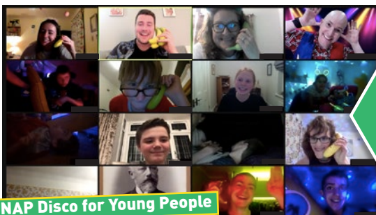
SNAP Disco for Young People

The enthusiastic SNAP Team and Emily have even launched a new activity - The SNAP Choir! Running remotely at the moment this session has been well received and the choir even recorded a song for the 24-Hour Kitchen Disco (see more on this on page 7).